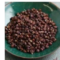
Grains of Paradise

More information on awards, press releases and trade press at www.darnleysview.com